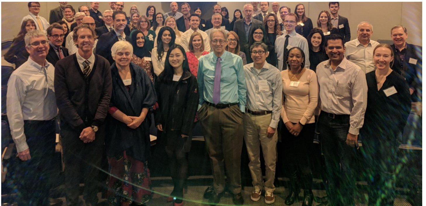
Optometric Glaucoma Foundation Annual Educators Program Friday, October 27, 2017 SUNY College of Optometry